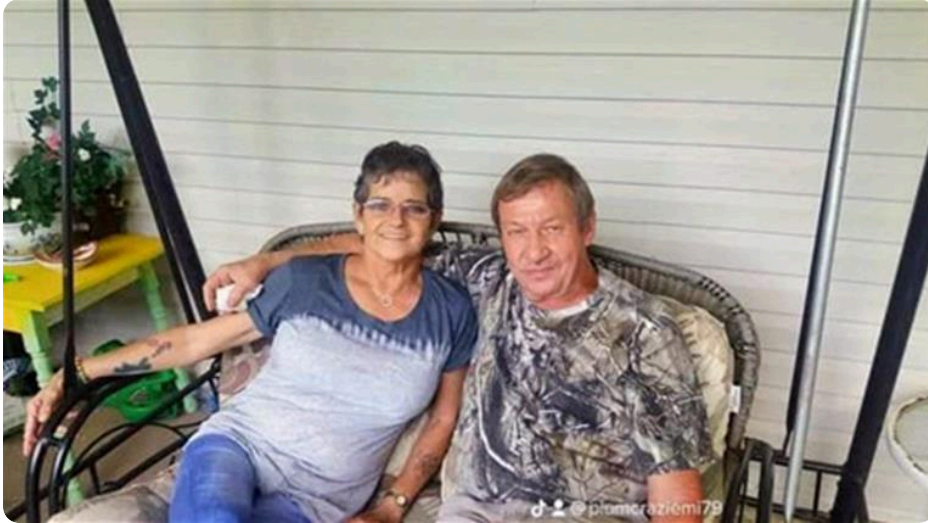
The love of her life!