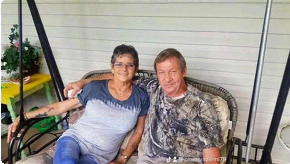
The love of her life!